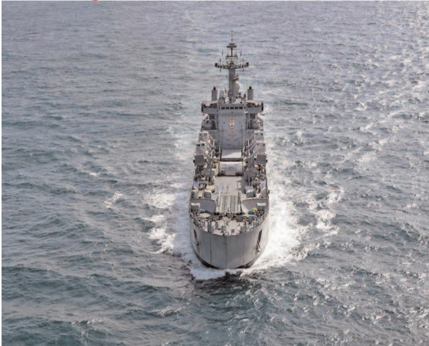
The 1st Training Squadron (comprising Indian Naval Ships Sujata, Magar, Shardul, Sudarshini, Tarangini and Coast Guard Ship Vikram) is on a four day visit to Sri Lanka from 24 - 28 Oct 21 as part of their Overseas Deployment for the 100th and 101st Integrated Officers Training Course.