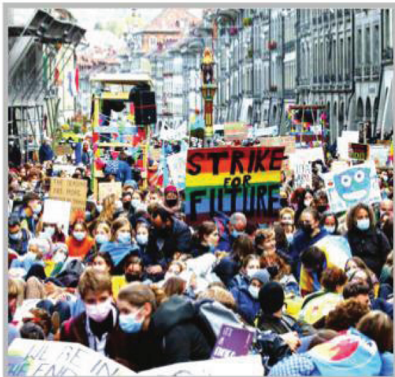
Protesters sit down as they take part in the Global Climate Strike of the movement Fridays for Future on the Kramgasse street in Bern, Switzerland.